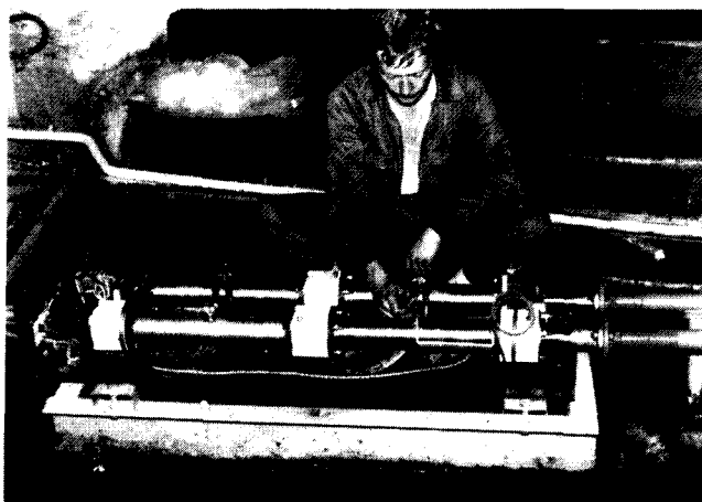
Fig. 3 — A view of the chlorine-generating cells.

a standard three-phase 50/60 Hz supply into the high-current, low-voltage d.c. power required by the cells. The main components of the power supply required to perform this function are as follows: a step-down transformer, a saturable reactor assembly, a variable controller, an auxiliary transformer, and a rectifier assembly. These components are housed in a single lockable power-supply enclosure.